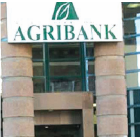
Agribank sets up $10million facility for horticulture.

which is a centre set up to pro-actively serve enterprise banking clients and is manned by dedicated business bankers. The enterprise banking customers are now able to reach business bankers for consultancy without having to enter the banking hall through electronic channels that include enterprise online banking. The enterprise direct centre helps to create value for its enterprise banking clients by giving them more time to run their businesses.